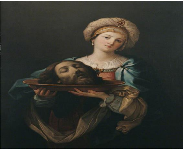
The Story of the Martyrdom of Saint John the Baptist